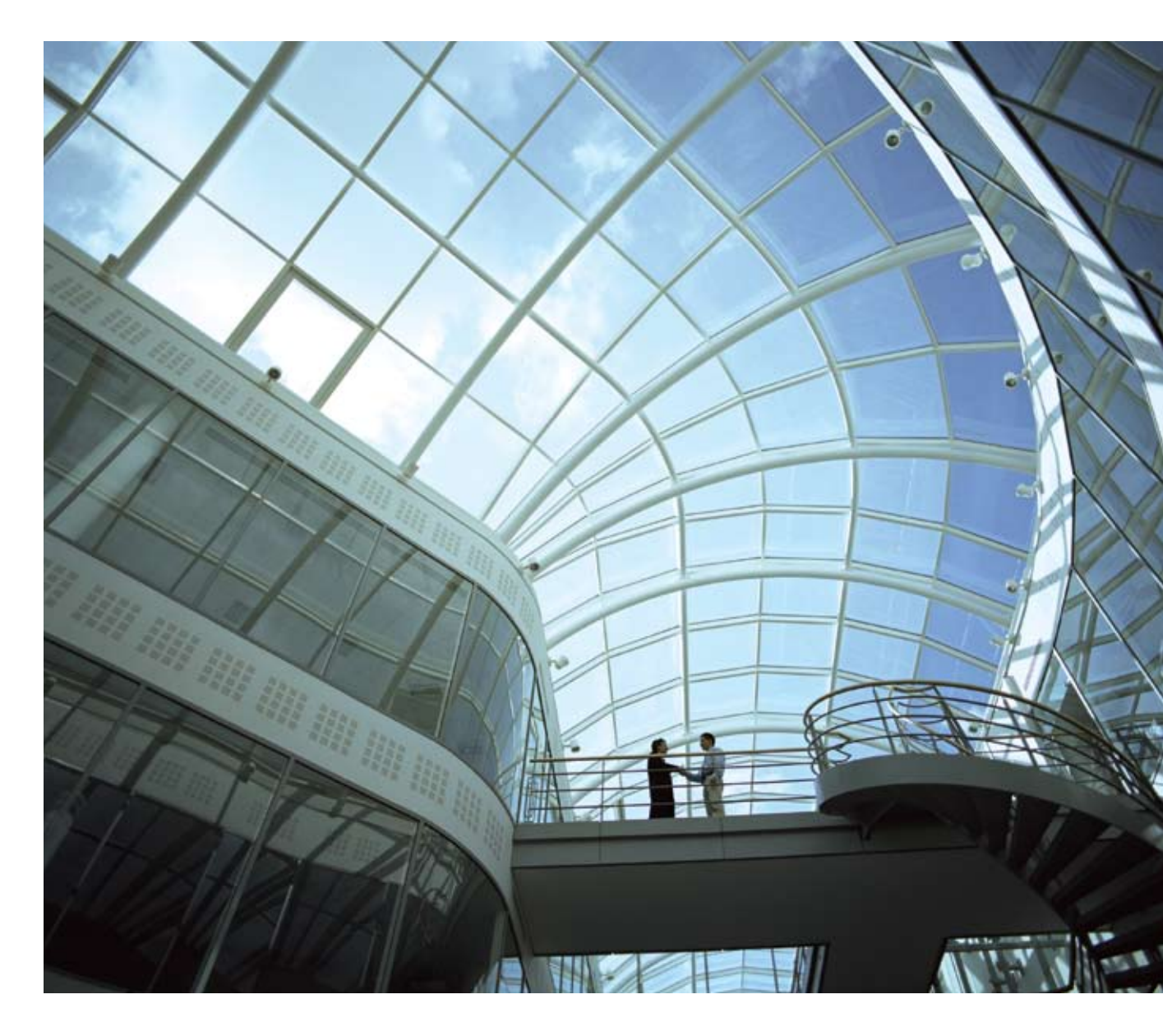
Leading hedge fund protagonists from across UBS's Investment Bank, Global Asset Management and Wealth Management businesses talk about the fast-evolving hedge fund arena, trends and opportunities